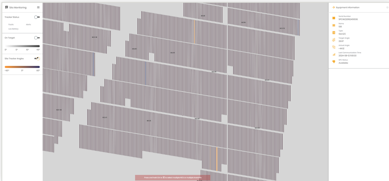
NX Navigator live map view

Quickly detect and correct plant performance issues with an intuitive graphical user interface and MapView, showing tracker equipment status, tracker angle, irradiance and more. Users can also gain real-time insights for fast and efficient problem detection, and issue block- or tracker-level commands for testing and resolution.